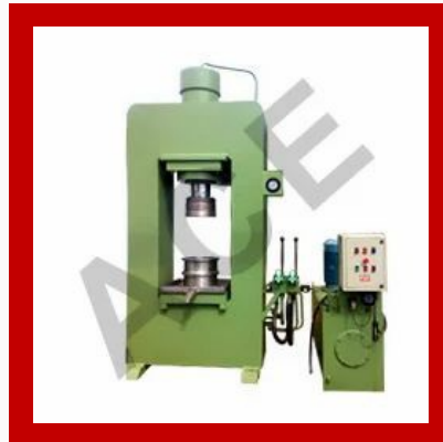
Closed Frame Hydraulic Press