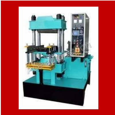
Hydraulic Hot Press Machine