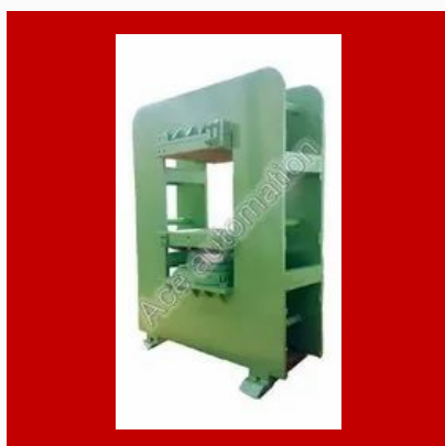
Solid Tyre Moulding Press