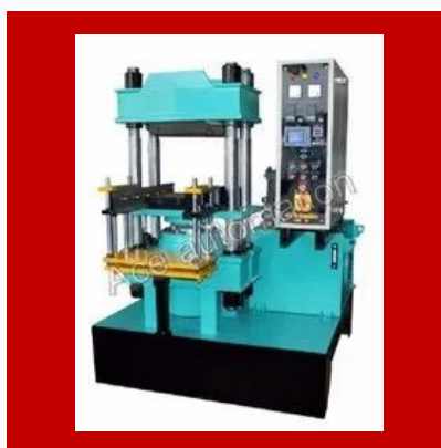
Hydraulic Rubber Moulding Press