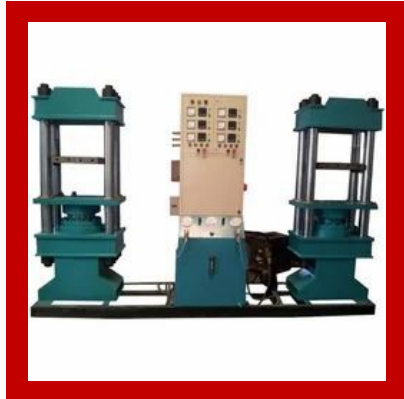
450 x 450 mm Double Station Rubber Compression Moulding Press, 150 Tons