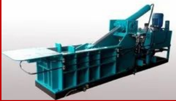
Scrap Baling Press-Horizontal- Double Compression