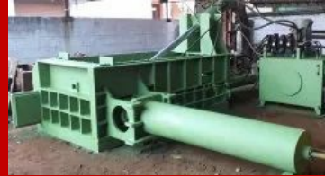
Horizontal Metal Scrap Baler-3 Compression