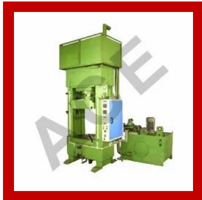
H Frame Hydraulic Presses