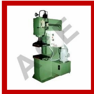
C Frame Hydraulic Presses