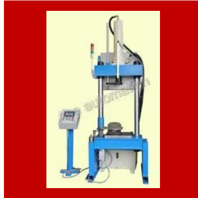
Hydraulic Wax Pressing Machine