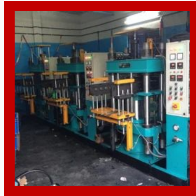
Press Line Machine