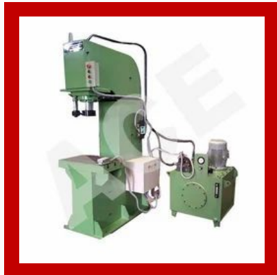
C Frame Press