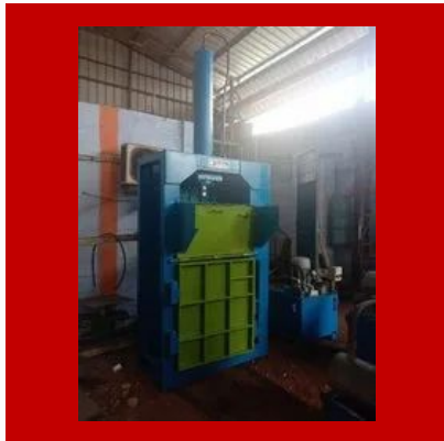
PET Bottle Baling Presses