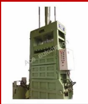
Paper Baling Machine