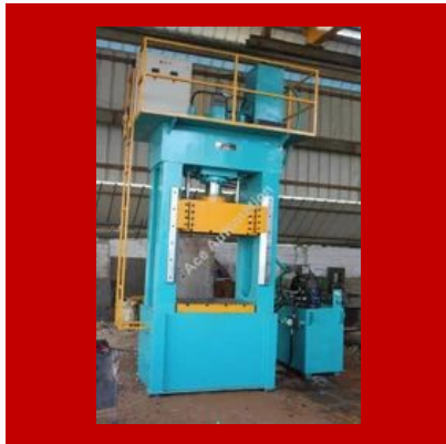
Hydraulic Deep Drawing Press