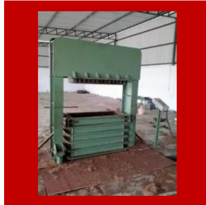
Coconut Fiber Baling Machine