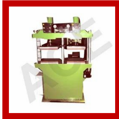
Leather Embossing Press