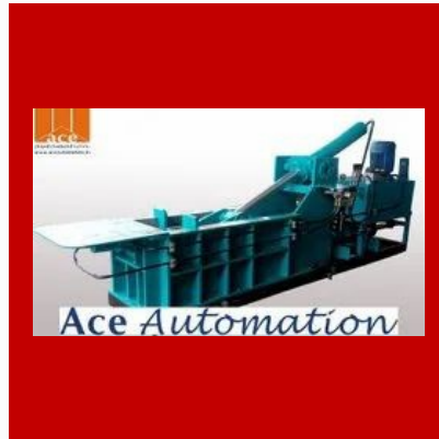
Scrap Baling Presses