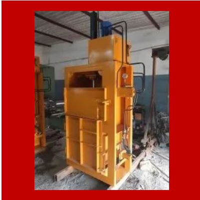
Vertical Baling Machines 12 Ton Eco