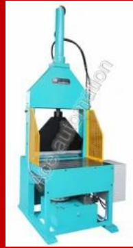
Rubber Bale Cutter