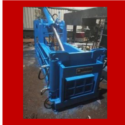
Scrap Baling Machine