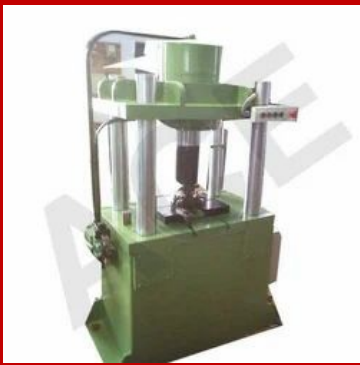
Hydraulic Coining Press