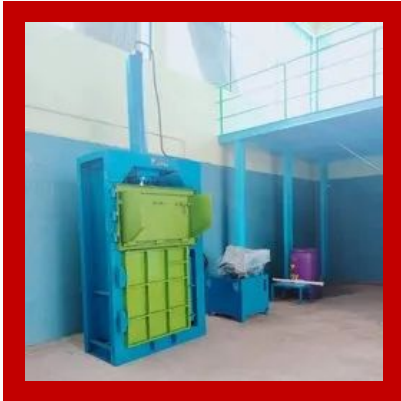
Baling Press Machine