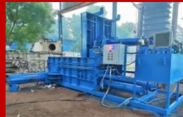
ACE Metal Scrap Baler