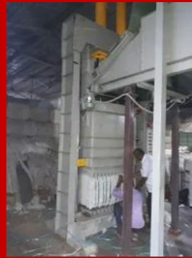
Cotton Baling Presses