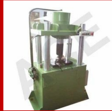
Hydraulic Forging Press