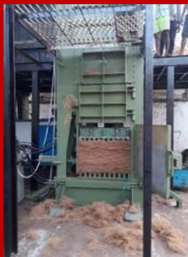
Coir Fibre Baling Press