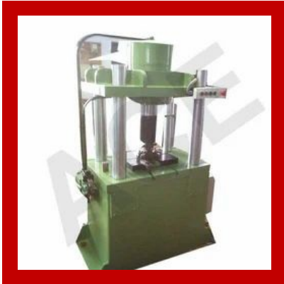
4 Pillar Hydraulic Press