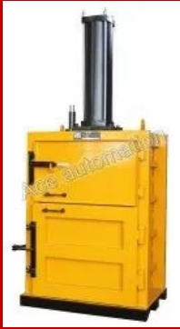
Waste Baling Machine