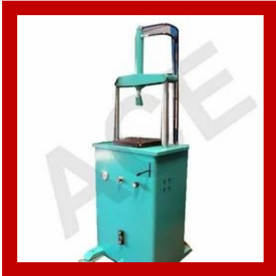
Pillar Assembly Press