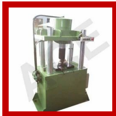
4 Pillar Press