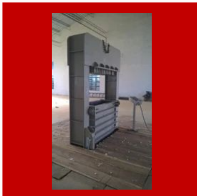
Coir Fibre Baling Machine