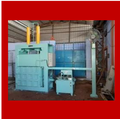
Paper Baling Presses