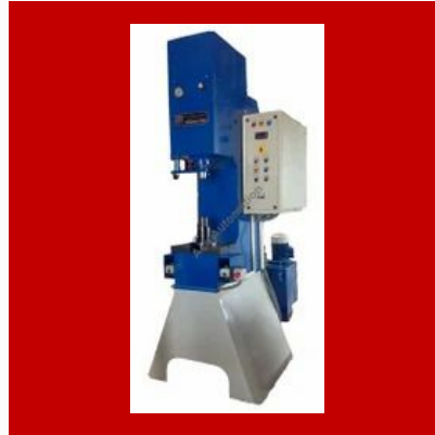
Hydraulic C Frame Press