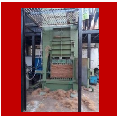
Coir Fiber Baling Machine