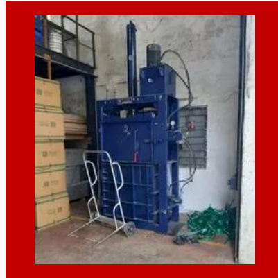
Hydraulic Bundling k.m.68op 5n