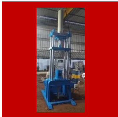
Pillar Hydraulic Press