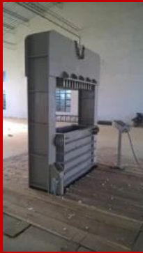
Heavy Duty Baling Press