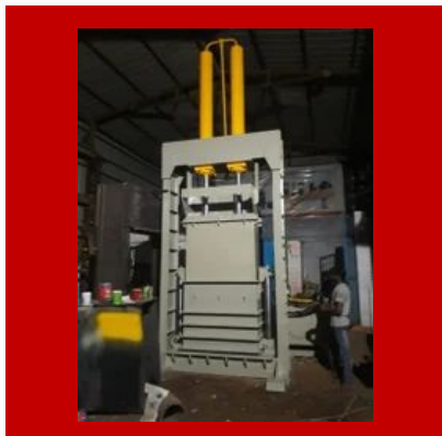
Fibre Baling Press