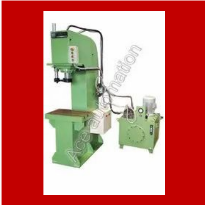
Hydraulic Punch Press