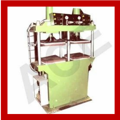
Four Pillar Presses