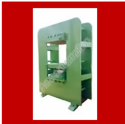
900 X 900 Mm Rubber Compression Moulding Press, 590 Tons