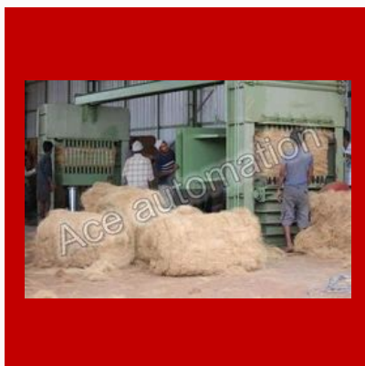
Coir Baling Press Machine