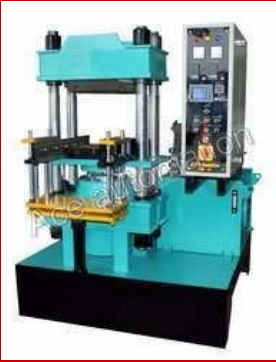
Hydraulic Rubber Molding Press