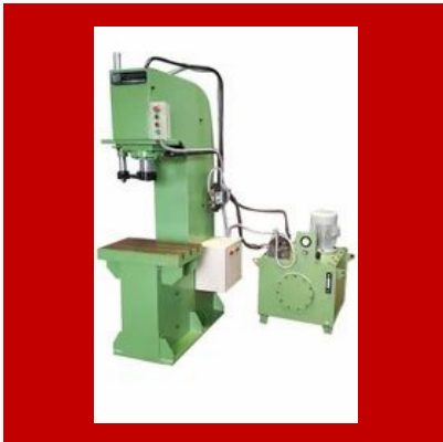
Hydraulic "C" Frame Press